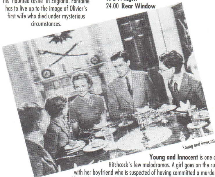
Young and innocent

Rebecca was Hitchcock's first film made in America. It is thoroughly British though, as it is based on a novel by Daphne du Maurier. Laurence Olivier is the elegant gentleman who meets Joan Fontaine on the Riviera and takes her to his 'haunted castle' in England. Fontaine has to live up to the image of Olivier's first wife who died under mysterious circumstances.