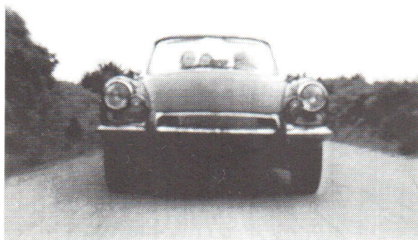
Split seconds of magnificence

In this video the film and cartoon world appear to make way for that of advertising and the picture novel. Some of the video images seem to be exact copies of advertisements from glossy fashion magazines or the fashion-conscious 'magazine for the young woman', while the projected slide images evoke that source even more directly. The narrative character of the tape, further enhanced by the texts depicted and the fragmentary build-up make 'Split seconds of magnificence' a contemporary variant of the picture novel.