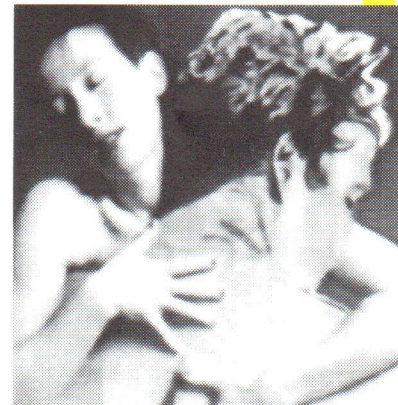
Romeo is bleeding

The maker of this tape moves in different roles through a setting which is partly determined by strip-like decors and partly by a primitive environment that suggests Africa. Connections are established between the cultures of Africa, South America and Australia, and, in a half-parody, half serious approach it is made clear that adventure, power and strength are not masculine prerogatives. Moving images are interspersed with stills which are illustrative of the statement of this work and which also from purely aesthetic considerations, form the high spots of this production.